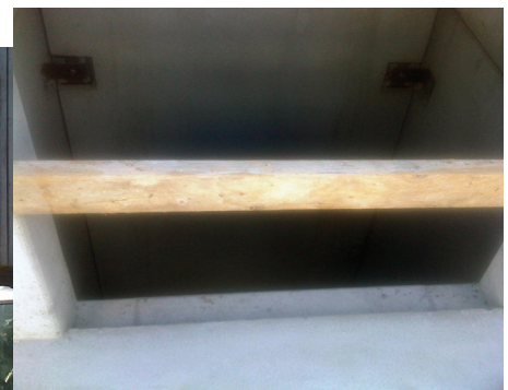
Lift well fall protection!