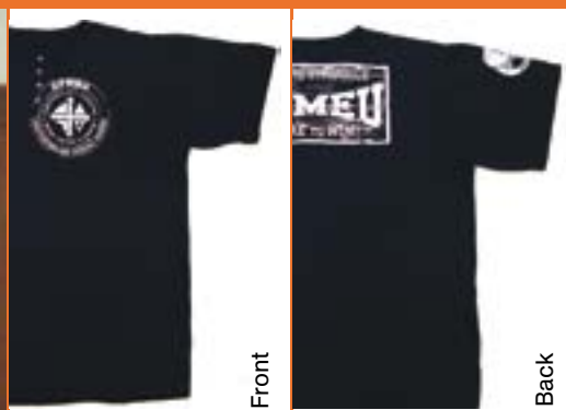
Short sleeved 'grandpa' navy or black $20, kids $15