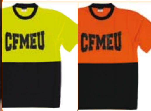
Fluro T shirts, yellow or orange $20